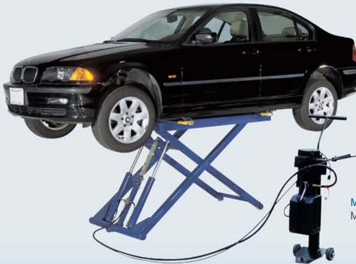
MR6K-48 Mid-rise lift

Mid-rise models lift cars, vans and light-duty trucks. They are ideal for tire, wheel and brake related repairs, collision repair work and new car preparation.