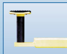
Stackable 3" and 6 ½" adapters